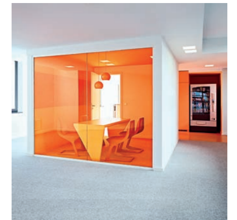
Main image & images on the left: Bikini Berlin Above: Groupon Below left: Zalando Below right: Dierks + Bohle

The globally operating American company Groupon established its new head office in the centre of Berlin. Originally, the building was used as a fashion house and has six floors, including a magnificent entrance hall with a historical staircase, which marks a strong contrast to the simplicity of the newly built rooms.